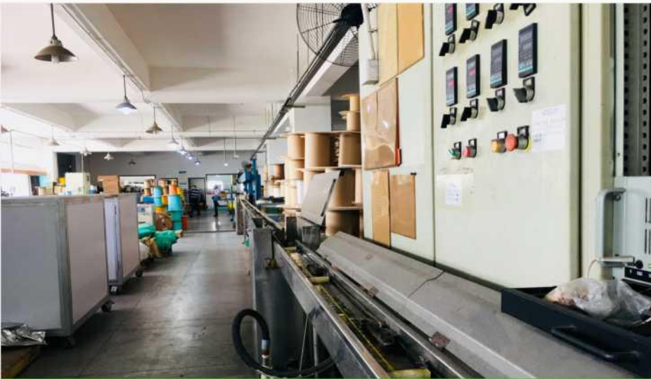
Fiber Optic Cable Extrusion Line

With more than 10 years of experiences in the fiber optic industry, About 100 well-trained staff and engineers are contributing to our proud products