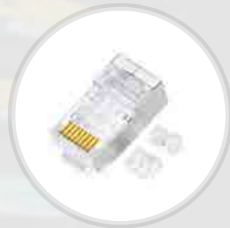
RJ45 Modular Plugs