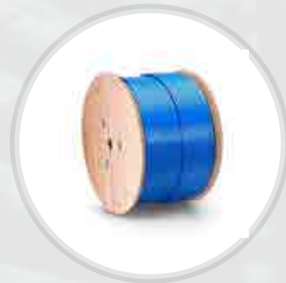
Network Lan Cables