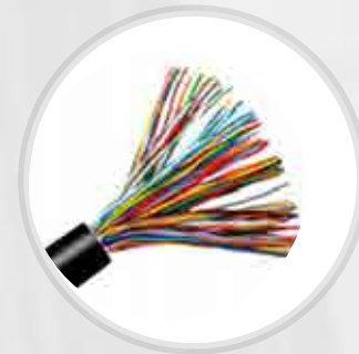
Multipairs Network Lan Cables