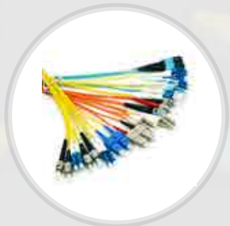
Fiber Optic Patch Cords / Pigtails