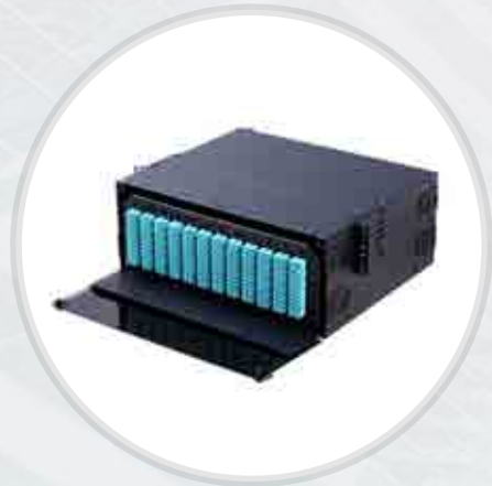
Optical Distribution Frame

ADTEK designs and manufactures fiber optic connectivity and cabling products utilized in extensive optical network applications throughout public and private sectors, like datacom, telecom and FTTX networking. We not only offer a complete line of superior quality products, but also work with our customers to develop new formulas and address the burgeoning market.