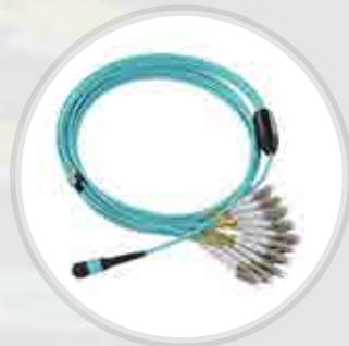
Pre-terminated Products (MPO/MTP)