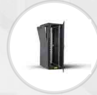
Data Center Cabinet