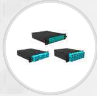
MPO Cassette (LGX/HD)