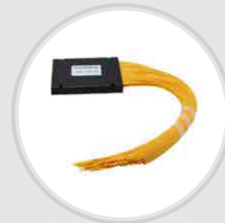
Optical Fiber Splitters