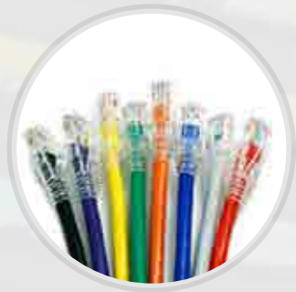
Network Patch Cords