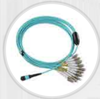
MTP-LC Harness Cable