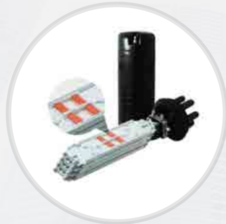
Dome / Vertical Fiber Optic Splice Closure