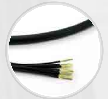
Indoor Cables/Outdoor Cables