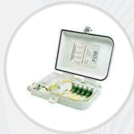
FTTH Terminal Box