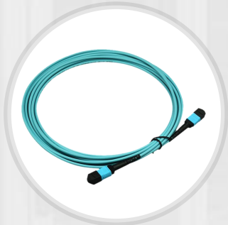
MPO Trunk Cable

Data centres are at the heart of any business IT capability. Independent of their respective sizes, high availability and peak performance are required all-day, every-day. As networks are designed, deployed, scaled up, and replaced, infrastructure managers are struggling to keep pace because of complex architectures and operations processes.