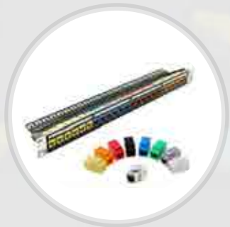
Network Patch Panels/ Keystone Jacks