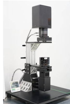
JAW Ellipsometry Retardation Measurement