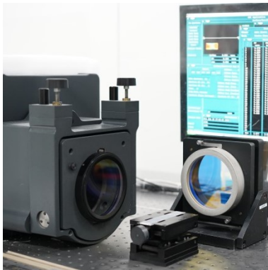
ZYGO Interferometer: parallelism & wave front Parallelism measure accuracy: 0.5 "