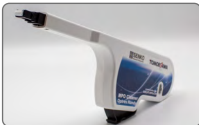
OPTRES HANDY MPO CLEANER PN: SCK-PT-MPO-CTR