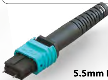
5.5mm Boot Option