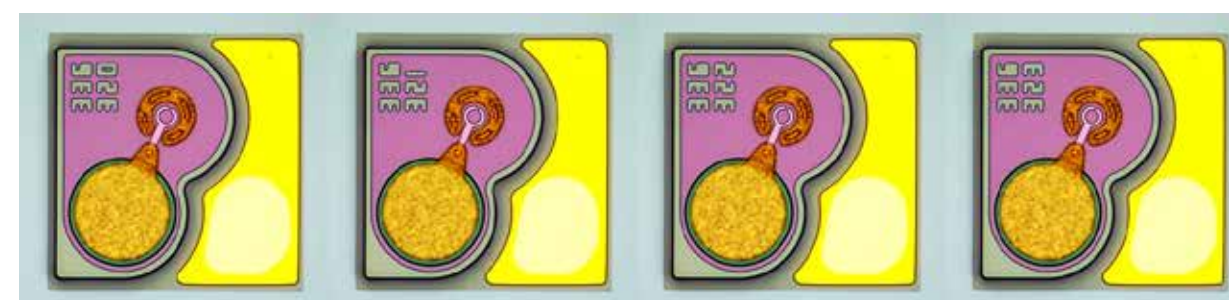
1x4 VCSEL Array