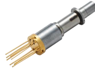
25G DWDM TOSA