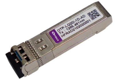
25G DWDM SFP28