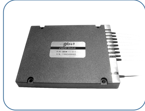
WDM ABS Module