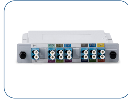
5G Fronthaul WDM Module