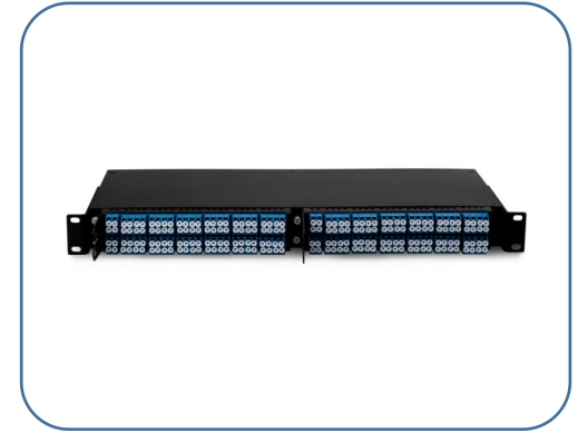
WDM Rack Mounted